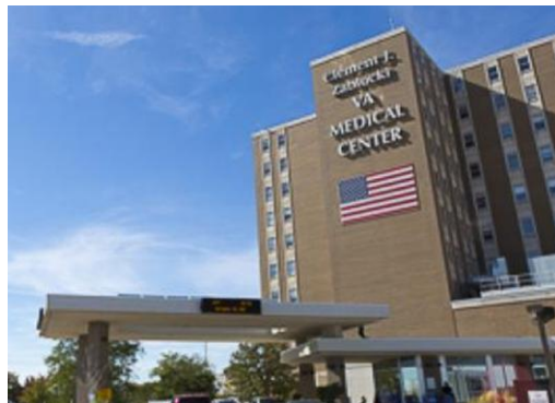
Milwaukee VA Geriatrics Consult Clinic