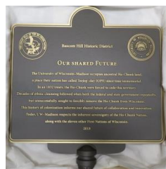
Our Shared Future

The University of Wisconsin-Madison recognizes the land it occupies is on ancestral Ho-Chunk land, a place their nation has called Teejop since time immemorial. In an 1832 treaty, the Ho-Chunk were forced to cede this territory. Decades of ethnic cleansing followed when both the federal and state government repeatedly, but unsuccessfully, sought to forcibly remove the Ho-Chunk from Wisconsin. This history of colonization informs our shared future of collaboration and innovation. Today, UW-Madison respects the inherent sovereignty of the Ho-Chunk Nation, along with the eleven other First Nations of Wisconsin.