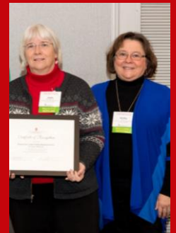
Preva Eau Claire Family Medicine Clinic