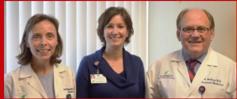
Aspirus Memory Clinic