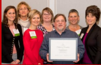
Door County Memory Care