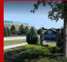
Aurora Two Rivers Memory Assessment Clinic