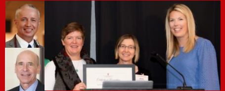
Center for Senior Health and Longevity