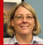
Senior Memory Assessment Center