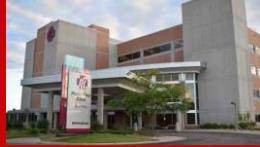
Marshfield Clinic Cognitive Neurology and Memory Disorders Clinic