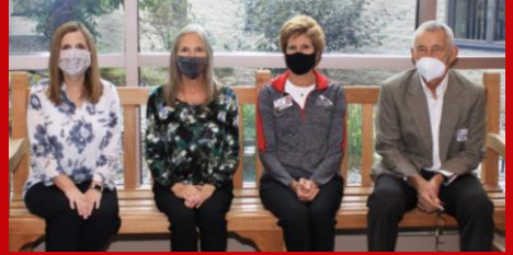
Mile Bluff Memory Assessment Clinic