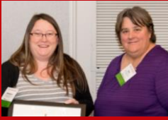
Stateline Area Memory Clinic