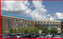
Center for Senior Health and Longevity Summit