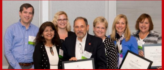
Froedtert and Medical College of Wisconsin Geriatric Disorders Froedtert and Medical College of Wisconsin Geriatric Psychiatry Clinic