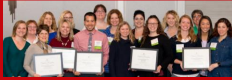
UW Health Neurology Memory Clinic