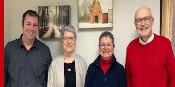
Richland Area Geriatric Assessment Clinic Reedsburg