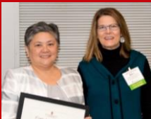
MIND Clinic (Gundersen Memory Center)