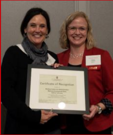
Madison VA Memory Assessment Clinic