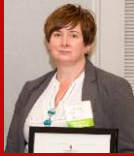
Monroe Clinic Memory Center