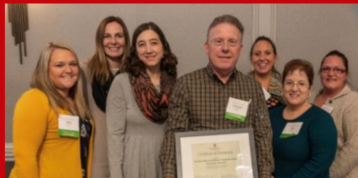
Northern Wisconsin Memory Diagnostic Clinic