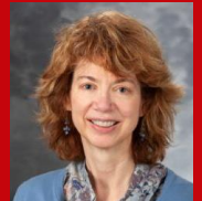
Green Bay Veterans Administration Health Care Center