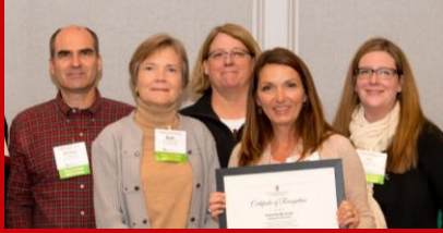
Prohealth Care Senior Health Services