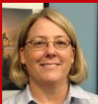
Senior Memory Assessment Center - St. Anne's