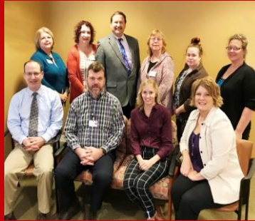
Lakeshore Memory Clinic