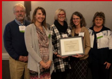
Mayo Clinic Health System Dementia Program