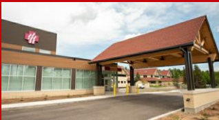
Marshfield Clinic Minocqua Center