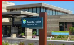
Essentia Health Ashland Memory Clinic