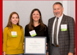
Mayo Clinic Health System Memory Care Clinic