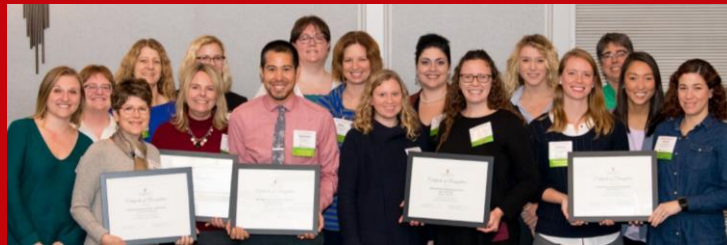
UW Health Specialty Clinic Sauk Prairie UW Health Neurology Memory Clinic 20 S Park Clinic UW Health East Clinic