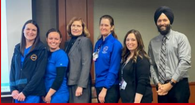
St. Croix Regional Medical Center Memory Clinic