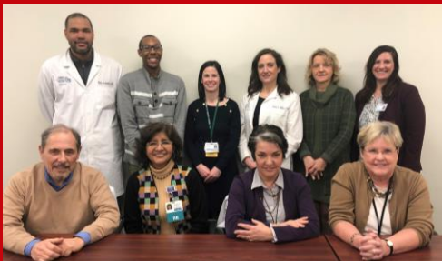
Froedtert and Medical College of Wisconsin Neurology Memory Disorders Clinic