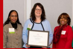
Milwaukee Health Services Memory Clinic