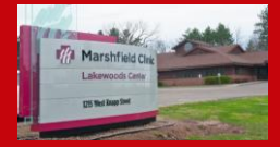
Marshfield Clinic Memory Disorders Clinic-Rice Lake