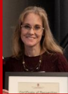
Geriatric Assessment Center