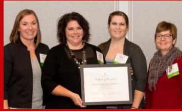
Southwest Health Center Memory Diagnostic Clinic