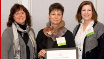
The Memory Care Center