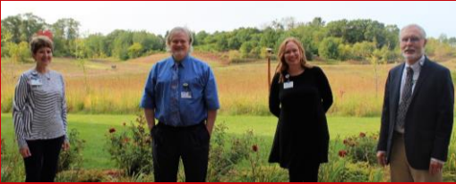
Spoooner Health Memory Clinic