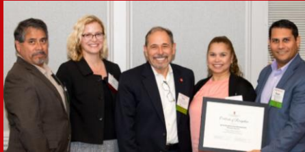
UCC Latino Geriatric Center