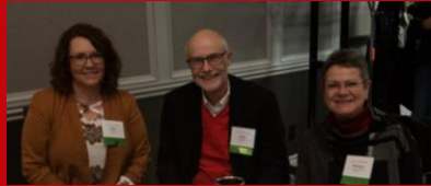
Richland Area Geriatric Assessment Clinic