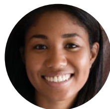
Nurse Care Manager