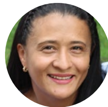
Your Care Manager