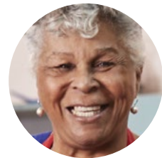
You, the member

Our Care Managers and Nurse Care Managers will help you manage your medical needs, as well as community and social services.