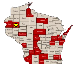
Rice Lake, Barron County