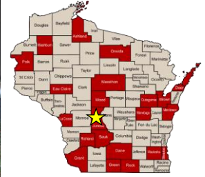
Mauston, Juneau County