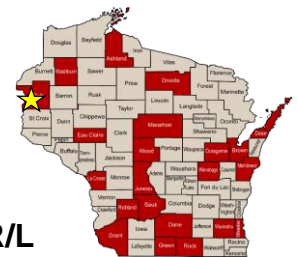
St. Croix Falls, Polk County