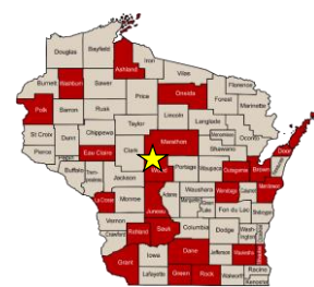
Marshfield, Wood County