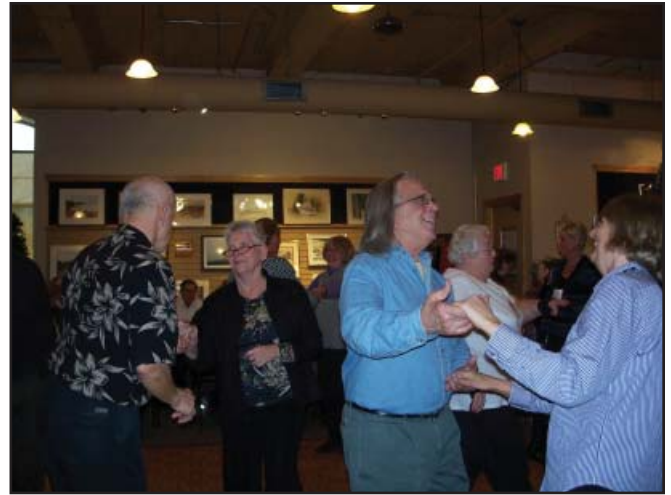
Any number of locations can make for an enjoyable memory café experience.