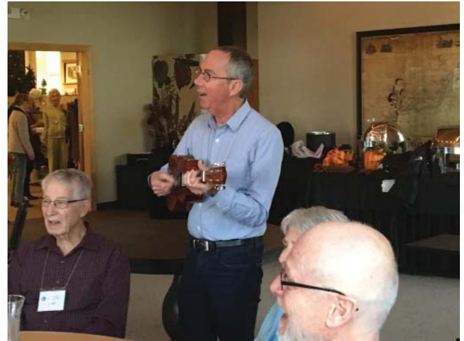
A song can be a wonderful way to begin the memory café.

Remember that people at memory cafés want to socialize, but may be hesitant about doing so with strangers. The volunteers have an important role to play in helping people feel comfortable by introducing them to one another. Also, for various reasons, some people may need to leave before the program ends. A volunteer can accompany them to the exit door.