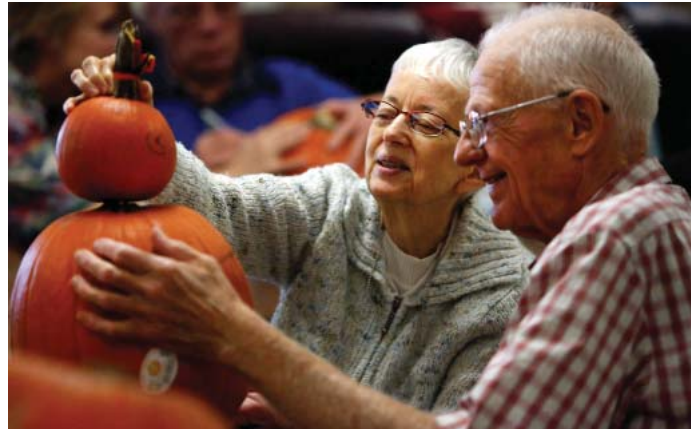
Participants enjoy a fun fall activity.

Activities at memory cafés vary widely and reflect the imaginations and resources of organizers. When outside groups come in—for example, to sing or perform on musical instruments—they should be told to make their program interactive and adult. In other words, we do not want to insult participants with childish programs, nor do we want them to passively sit and be entertained. There should always be some way for them to be involved with the program.