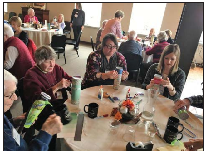
Memory cafés are all about the people...and the fun!

When we speak of people living with dementia, we include individuals who have some form of dementia as well as